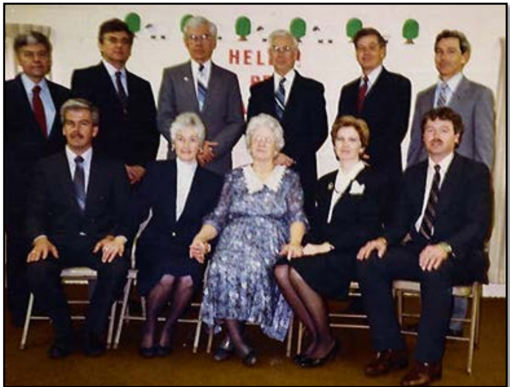
Right: Picture taken the day of Dad's Funeral on March 8th of 1990 at All Saints Hall in Cannelburg.