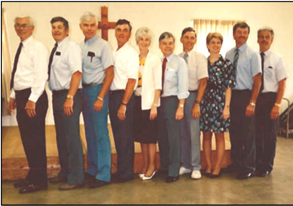
Left: Picture taken at Mom's 80 th birthday in June of 1993 at All Saints Hall in Cannelburg.