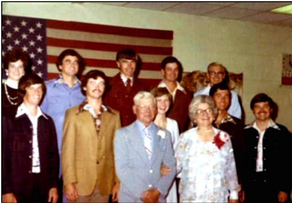
Left: Picture taken at Mom/Dad's 40 th Wedding Anniversary in July, 1976