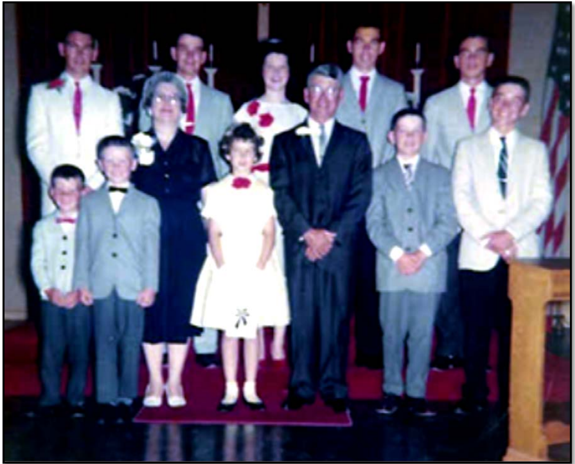
Right: Picture taken at Mom /Dad's 25 Wedding Anniversary, July, 1961