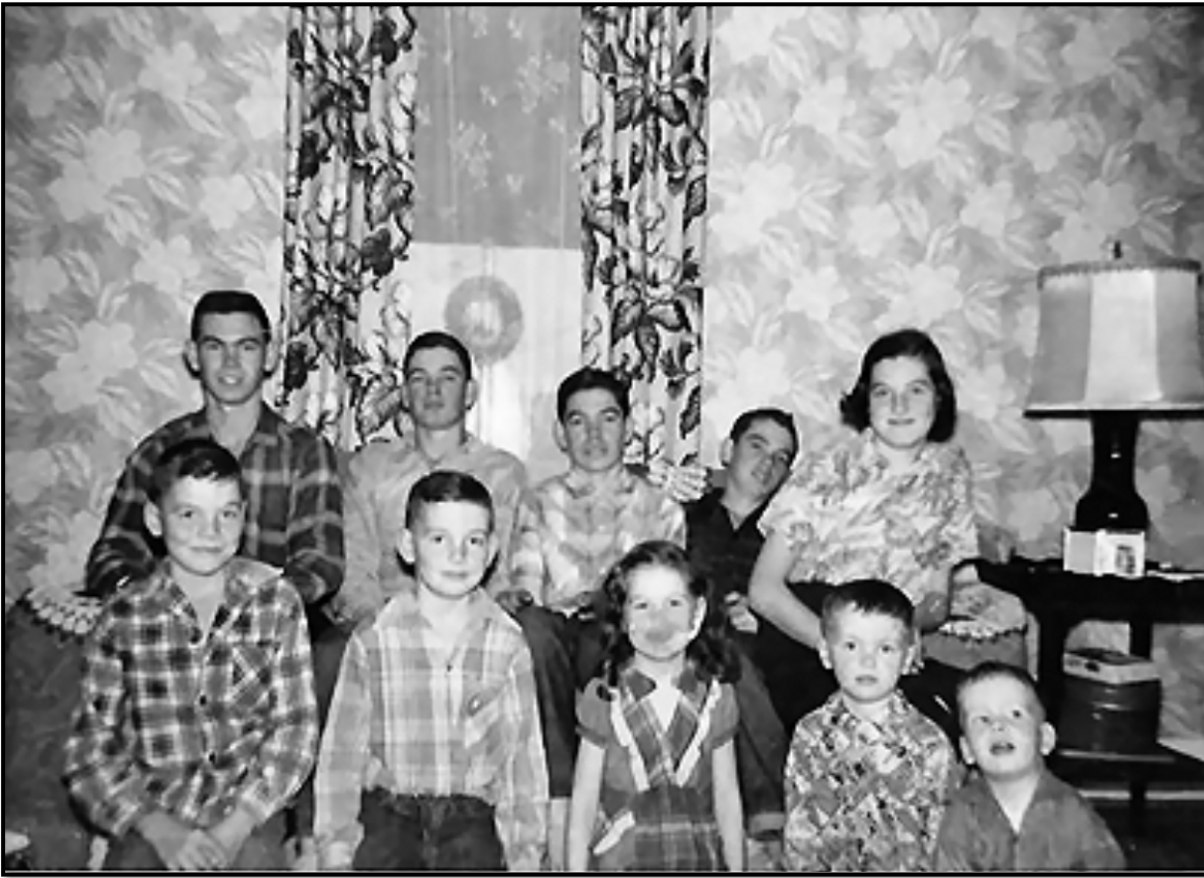
Left: Picture taken on Christmas in December, 1956