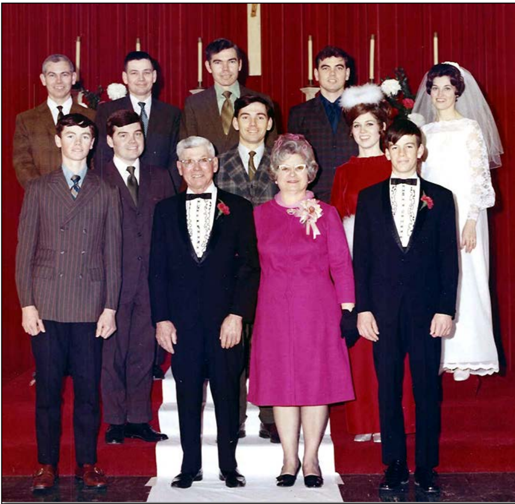
Left: Picture taken at Kay's Wedding on January 23, 1971